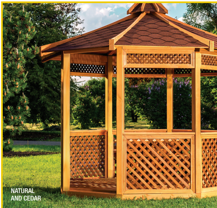
NATURAL AND CEDAR

For a richer, more finished appearance that allows the natural look of the wood to show through in a luxurious toned satin finish.