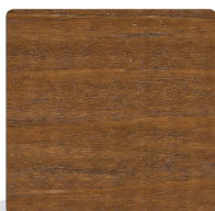
Dark Oak 47

For a richer, more finished appearance that allows the natural look of the wood to show through in a luxurious toned satin finish.